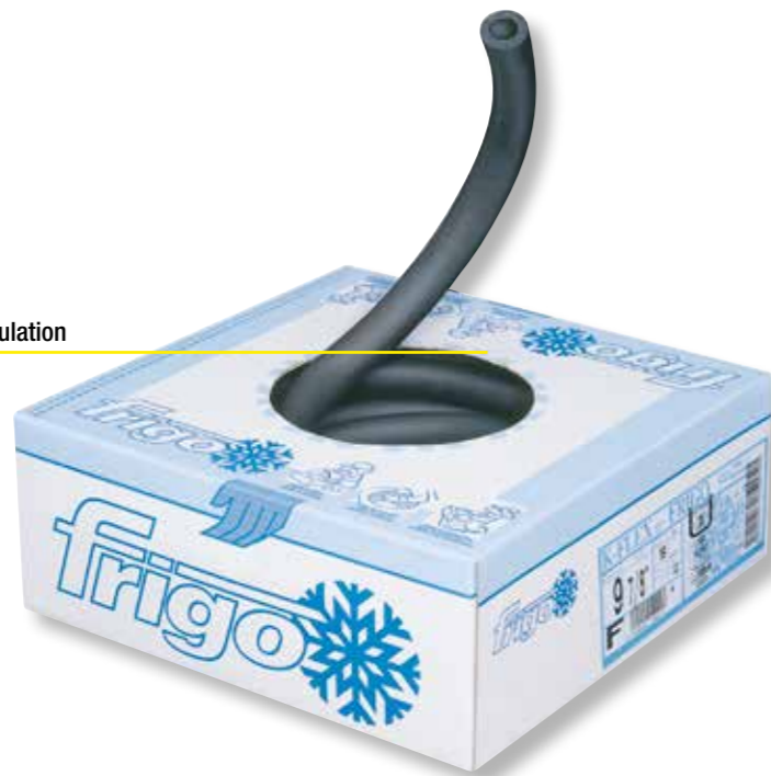
K-FLEX ST elastomeric insulation